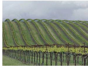
Yolo County Vineyards

For detailed meeting and agenda information, please visit www.yolowra.org