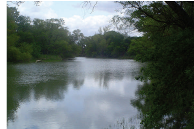
Putah Creek south of Davis

In 2004, the WRA Board of Directors re-focused the organization to improve functionality and value for its members, while preserving the original goals of the WRA to protect and