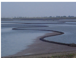
Rice field County Road 98

Local and regional collaboration is essential for growth in management of water resources for Yolo County.